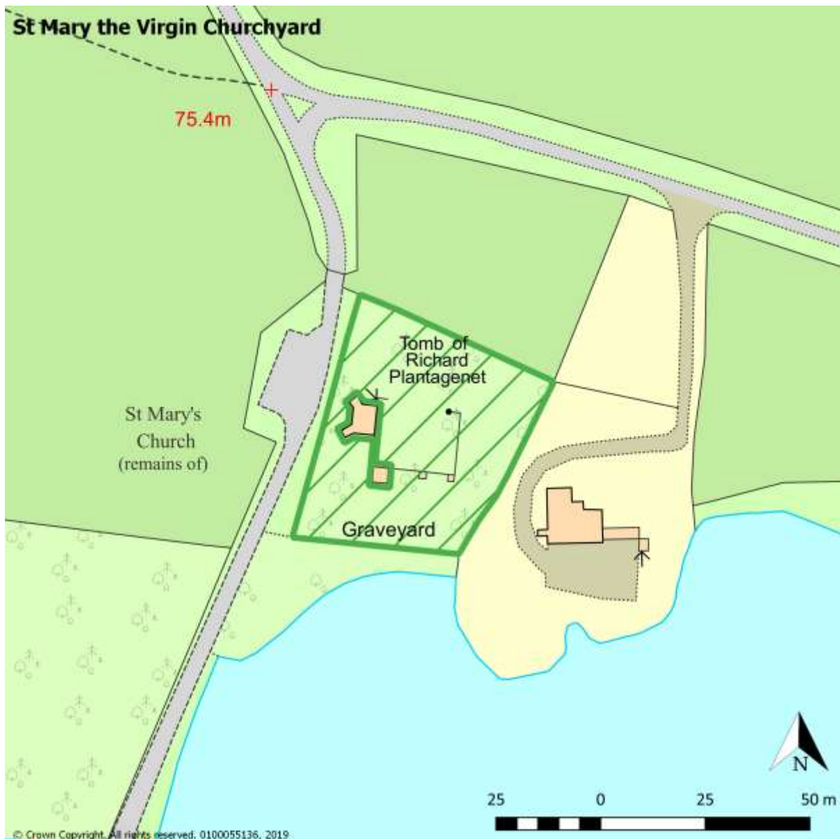
Map 8 – St Mary the Virgin Churchyard, Eastwell (LGS3)