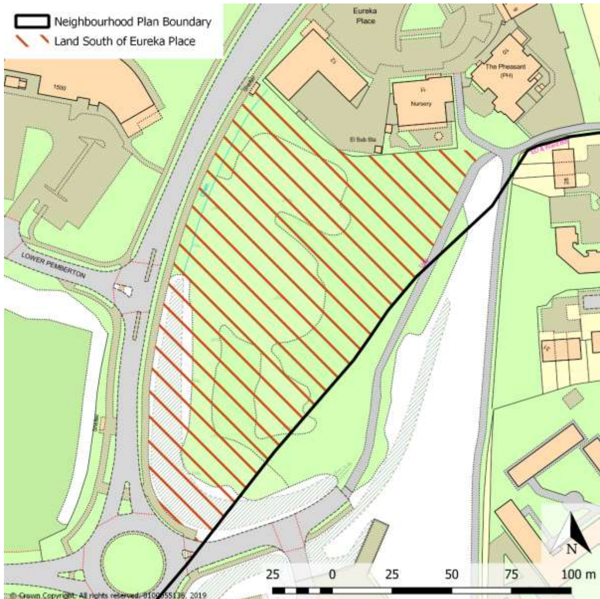
Map 21a – Land South of Eureka Place Local Centre

The site is located within the Eureka Park Local Plan allocation for a ‘higher-order’ business park for the town (Use Class E) and residential development (Use Class C3) and its future use should therefore be within such use classes. However, the mix of uses allowed within Use Class E includes shops and services and the Neighbourhood Plan expresses the ambition for additional local centre uses within Use Class E to be located on land to the south of Eureka Place Local Centre and for this to be addressed through the masterplanning stages for the wider site.